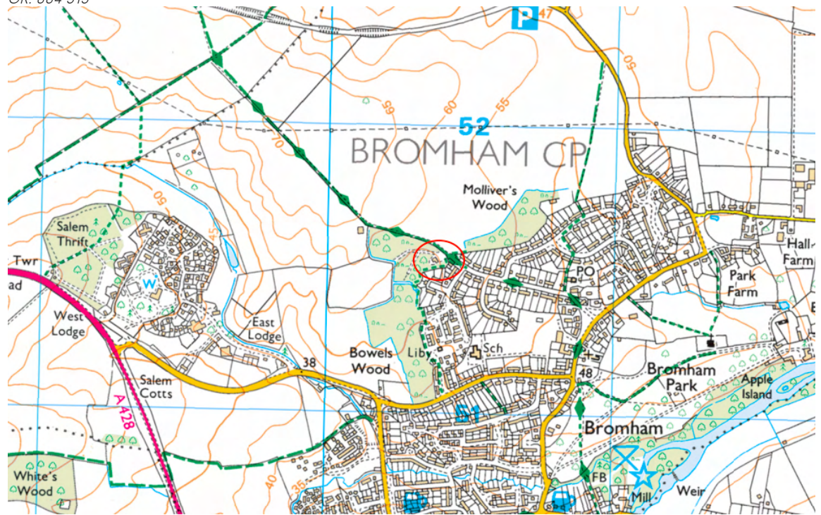
OS Map for The Leslie Sell Activity Centre