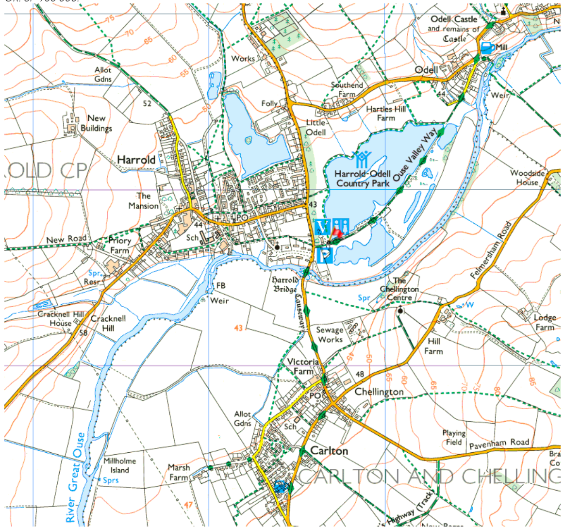
OS Map for Harrold Odell Country Park

Finish location, postcode and grid reference (18 Apr)