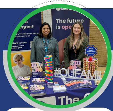
The Open University