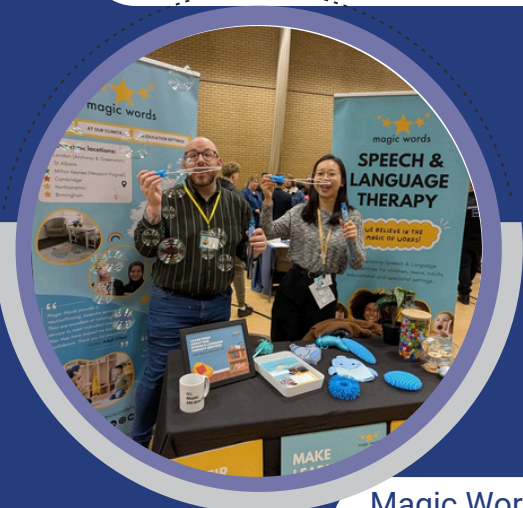
Magic Words - Speech and Language Therapy